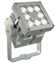
Item #: R-2-X-03-3